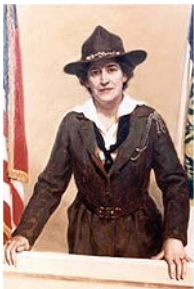
Juliette Gordon Low Inductee 1992

The first Georgia Women of Achievement induction ceremony took place in 1992 at Wesleyan College in Macon, Georgia. Since then, new inductees have been honored each year through ceremonies in various locations. The ceremonies take place in March, in celebration of Women's History month.