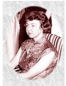
Flannery O'Connor Inductee 1992