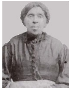
Harriet Powers 2009 Inductee